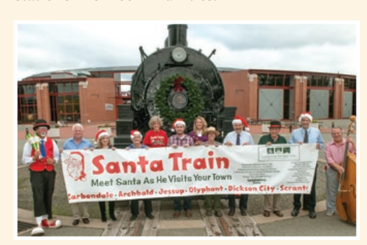
Committee members and performers planned the 20th Annual Christmas in a Small Town: The Santa Train.