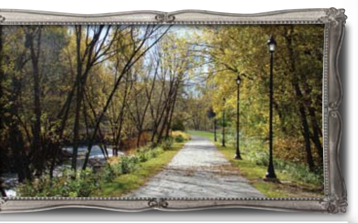
The Lackawanna River Heritage Trail in Scranton.