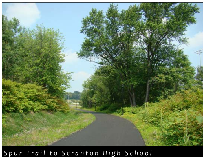
Spur Trail to Scranton High School