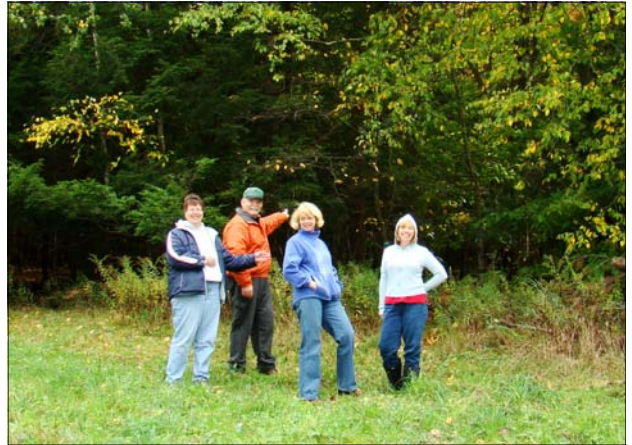
Teachers from the Blue Ridge School District in New Milford, PA, show the entrance to the Nature Trail they are developing at their school campus with funding from an Educational Mini-Grant.