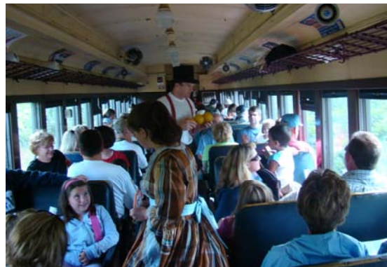
Families enjoy entertainment and costumed historical characters on the Heritage Explorer Train.

The Heritage Explorer Train was sponsored by LHVA in partnership with the Carbondale Chamber of Commerce, City of Carbondale, Lackawanna County Library System, Lackawanna Historical