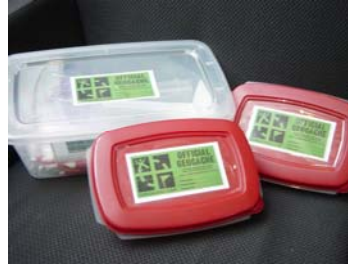
LHVA has placed three new geocaches along the Lackawanna River Heritage Trail.