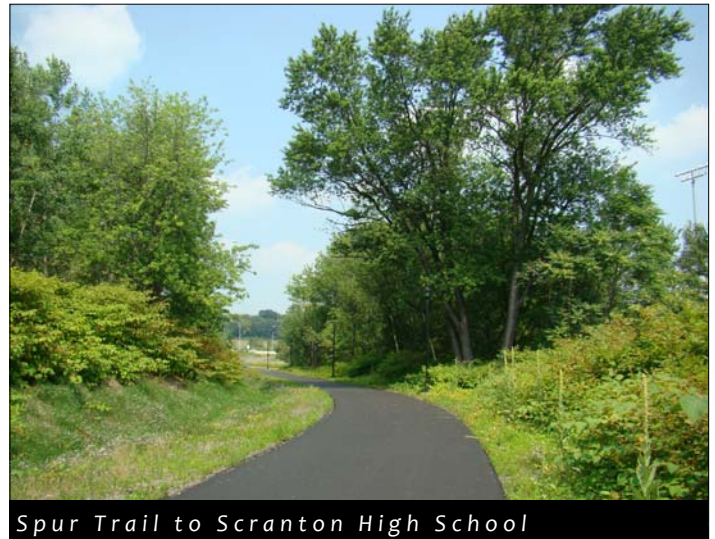
Spur Trail to Scranton High School