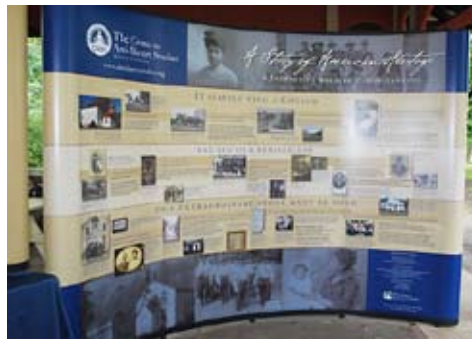
The Center for Anti-Slavery Studies created a series of traveling exhibits on the history of the nineteenth-century Underground Railroad in Northeastern Pennsylvania with funding assistance from LHVA.

Grant applications are assessed based on (1) the merits of the project; (2) how well