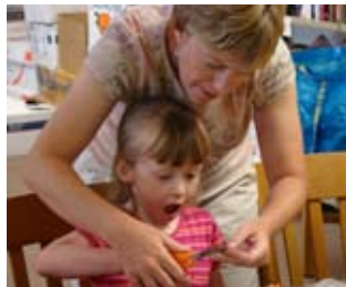
The Lackawanna County Library System used a Community Challenge Grant to help fund the annual Summer Heritage Passport Program.

The Lackawanna County Library System is proud to report that 3,580 children registered for the Summer Reading Club and received a passport as part of the Summer Heritage Passport Program. The passports allowed area children to explore seven cultural and historic attractions free of charge between June 16 th and August 24 th . The sites tallied 1,032 visits from passport holders during this period, up from 477 visits in 2007. Many parents reported that they were staying close to home and taking advantage of library programs this summer due to the high cost of gasoline.