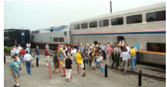
Lackawanna Railfest 2008 showcased modern and historic railroading at Steamtown National Historic Site with the assistance of a LHVA Sponsorship Grant.

The Lackawanna Heritage Valley Authority works with partners to tell the Lackawanna Heritage Valley's story using creative projects and programs. LHVA's Partnership Grants Program provides funding assistance to nonprofit organizations, municipalities, and public agencies for community-based projects.