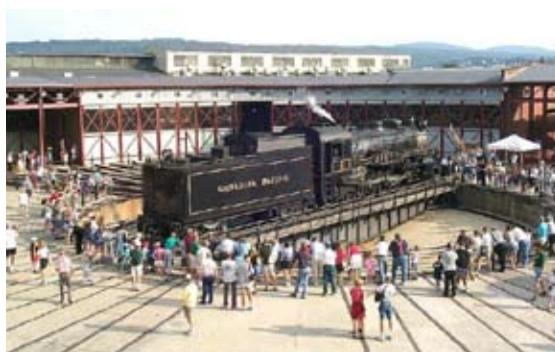
Visitors watch the turntable at Steamtown National Historic Site in downtown Scranton.

LHVA is proud to join a number of National Heritage Areas from other parts of the country in conducting visitor surveys that gauge the economic impact of tourism in this region. The 2008 Economic Impact of Heritage Tourism Spending surveys are a key component of a broader study that seeks to identify the far-reaching effects that heritage-based tourism and development have on local economies.