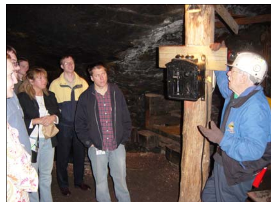
A tour of the Lackawanna Coal Mine Tour is part of the popular “Museums as Classrooms I” course offered by the NEIU 19.