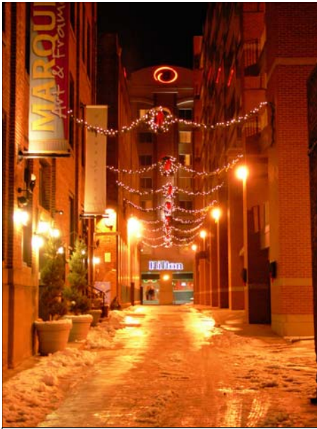
Center Street in Scranton puts on a festive air for First Night 2008.

During the first quarter of 2008, LHVA awarded $47,975 to eleven partner organizations, with grants ranging from $100 to $20,000. This funding was matched dollar-for-dollar by each organization. In many cases, LHVA's contribution was a catalyst for leveraging significant funds from other sources.