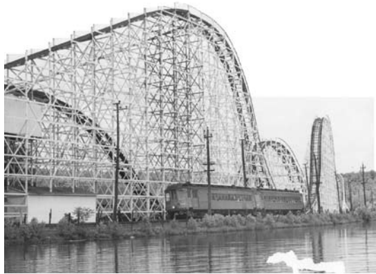
The Laurel Line trolley passes the roller coaster at Rocky Glen Amusement Park.