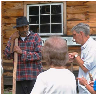
A "conductor" prepares to take his group on their quest for freedom during "Experience the Underground Railroad."