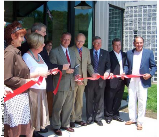
Officials premiere the Lackawanna County Coal Mine Tour's new Interpretive Center at McDade Park with a ribbon-cutting ceremony on July 6, 2007.

LHVA supported the project with a $45,000 grant. The Lackawanna County Coal Mine Tour and Interpretive Center are open daily from 10 a.m. to 4:30 p.m. Info: (570) 963-MINE or coalmine@lackawannacounty.org .