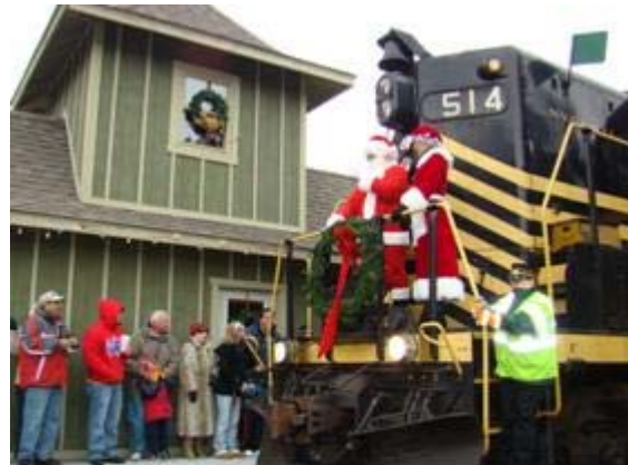
Santa and Mrs. Claus are greeted in Archbald at their arrival on the Santa Train.

Saturday, December 6, 2008, marked year eleven for the "Christmas in a Small Town" program, also known as Santa Train, a favorite holiday event in the Lackawanna Heritage Valley. Riding in style aboard a train from Steamtown National Historic Site, Santa Claus, Mrs. Claus and their helpers arrived in Carbondale, Archbald, Jessup, Olyphant, and