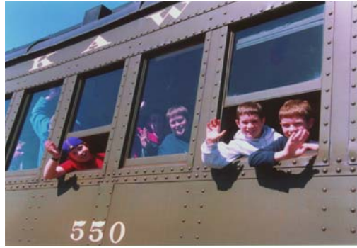
Happy faces on the train!

Fun for the whole family! On Saturday, August 18, join us on the Heritage Explorer Train as we ride the rails from Scranton to Carbondale for Pioneer Nights. The train ride includes activities, snacks, entertainment, and more. In Carbondale, enjoy a parade, a scavenger hunt, and plenty of good food. The train departs from Steamtown National Historic Site at 10 a.m., and will arrive back at approximately 4:30 p.m. Tickets are free for children 12 and under! Adult tickets are $5.00, and tickets for seniors 65 and over are $4.00. All passengers require a ticket and seating is limited. Visit a Lackawanna County library from July 15 to August 15 to pick up your tickets. Children under 16 must be accompanied by an adult. Info: Lackawanna County Library System at (570) 348-3003 or www.lclshome.org .