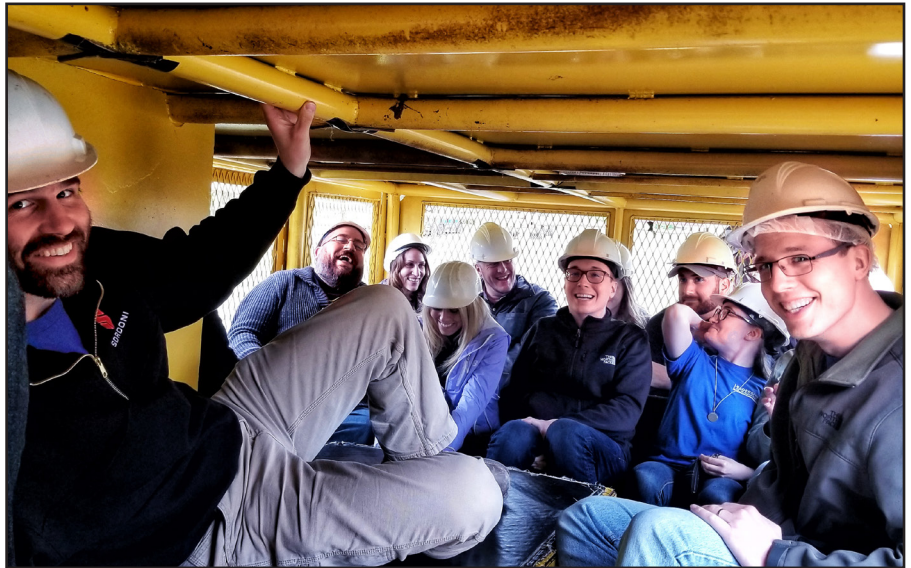
Members of Leadership Lackawanna’s 2019 Core Leadership Group are seen as they descend in a mine car into the Lackawanna Coal Mine Tour. This excursion was one stop of many during the History and Heritage Tour led by Lackawanna Heritage Valley and regional partners.