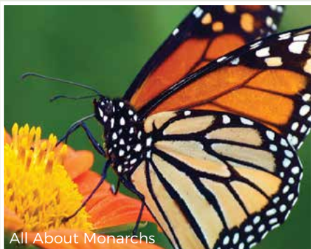
All About Monarchs

More than one hundred 5th grade students enjoyed outdoor classroom learning about macroinvertebrates, streambank restoration, and environmental stewardship at Sweeney's Beach in Scranton.