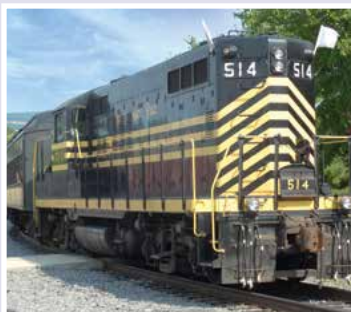
Heritage Explorer Train