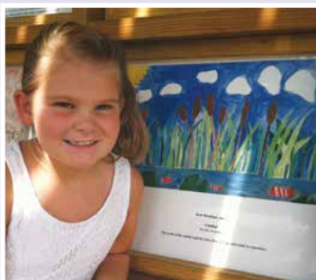
Art in Nature Exhibit

Launched in April, nearly 1,000 people of all ages participated in this GPS-guided geocache hunt, encompassing 12 of Scranton's most treasured historic sites. Participants can collect puzzle pieces at each site. Completed puzzle submissions are eligible to win prizes.