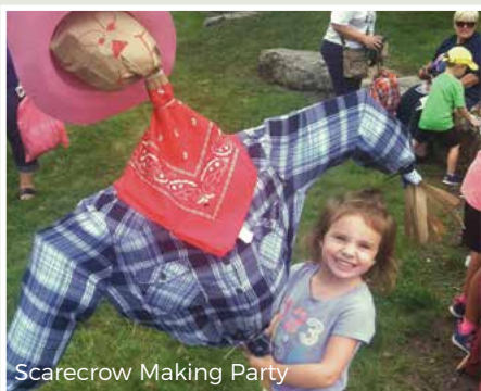
Scarecrow Making Party

This sign has great information on Olyphant, including photos and historical facts. Check it out the next time you are walking by the Olyphant Train Station Platform.