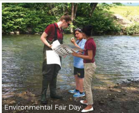
Environmental Fair Day